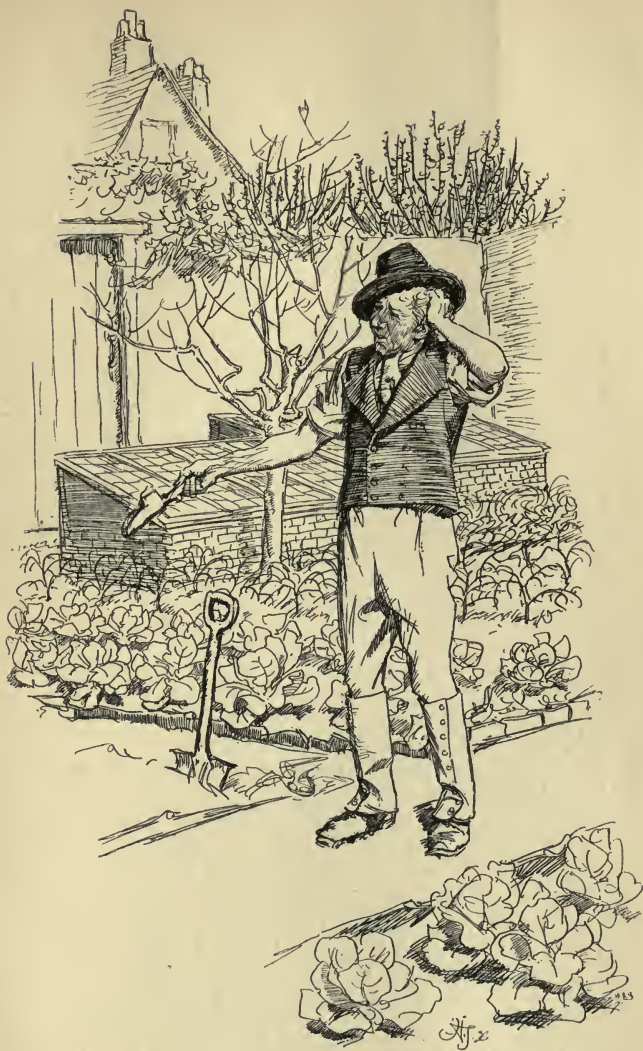
The gardener's lamentations.